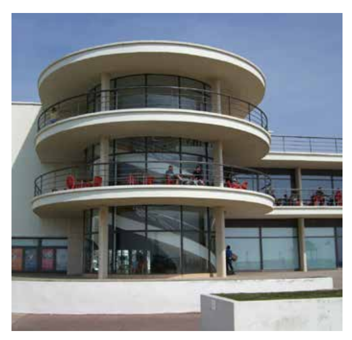
The De La Warr Pavilion, Bexhill-On-Sea

The pavilion is now a magnet for visitors from the UK and overseas as well as for the local community many of whom, having retired to Bexhill, particularly enjoy the accessibility of the transformed centre.