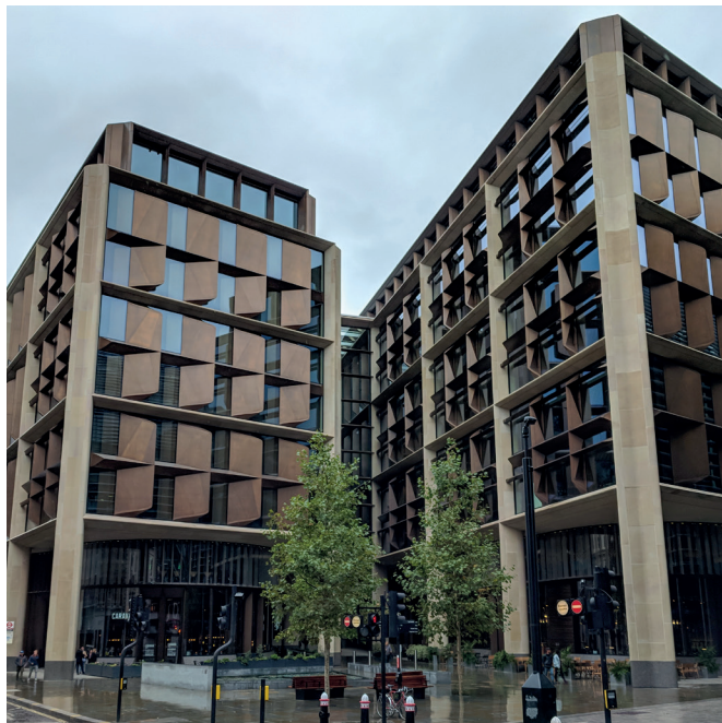
Bloomberg European Headquarters, London

The interior enables everyone to enjoy equal facilities - accessible toilets are finished to a very high standard with innovative features (such as concealed drop-down grab rails). The use of advanced technology is employed to enable independent access within the building and the opportunity for people with sensory impairments to communicate in meeting and conference rooms as well as in the auditorium and TV Studios.